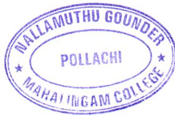
PRINCIPAL N G M COLLEGE POLLACHI

A computer lab with internet access and software applications for creating and presenting projects, assignments, and reports related to home science.