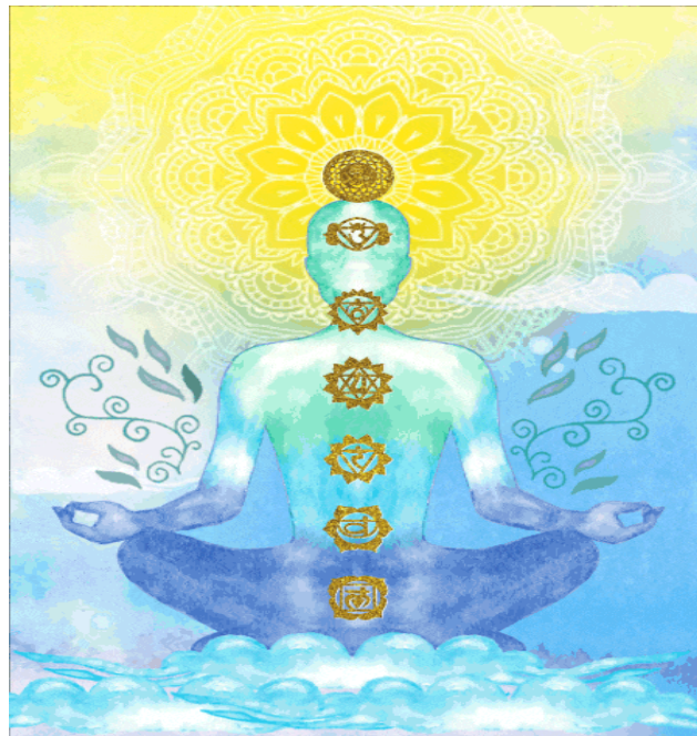
Fig: “Simplified Kundalini Yoga (SKY)” YOGA

Ancient Indian Yogic Practices and in the medicinal disciplines of Ayurveda, Siddha and Homeopathy. Achieve Success through SKY, beat Stress and enjoy enduring happiness.