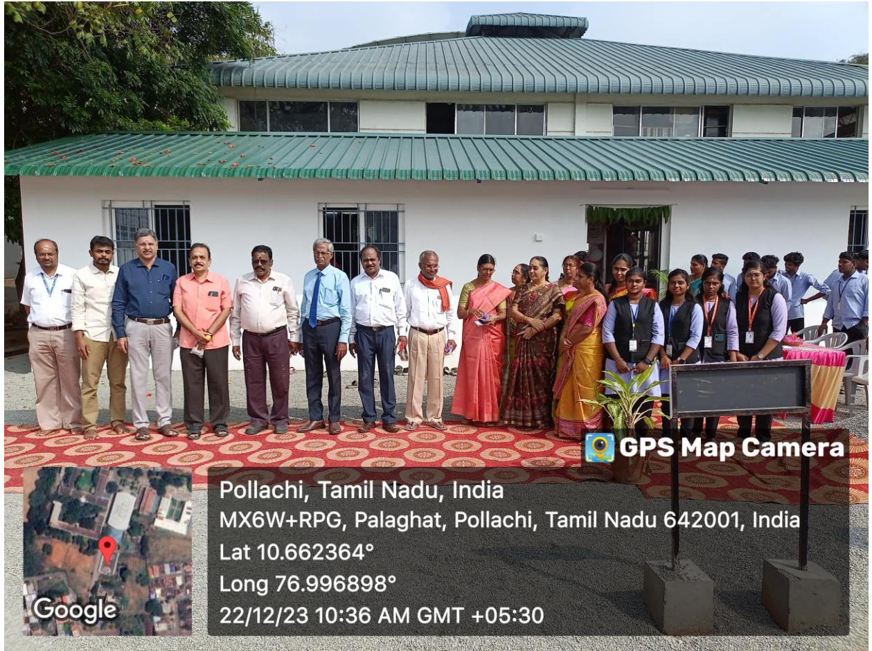
Inauguration of Startup up “NANDHA HOME MADE NATURAL PRODUCTS AND SWEET PARADISE HOME MADE SWEETS”